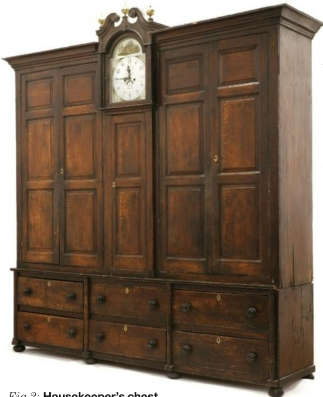
Fig 2: Housekeeper's chest, centred on a longcase movement. £7,750