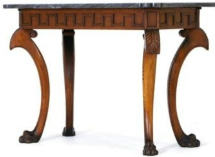
Fig 1: Oak pier table with paw feet, about 1820, by Robert Strahan of Dublin. £4,750

Whatever the hard work, contents auctions are among the most enjoyable occasions in an auctioneer's life and Sworders certainly enjoyed themselves with the on-site Holkham attic sale in February ( Art Market, February 26 ) and again with the principal contents of Boden Hall, Cheshire, this time removed to the auction house in Stansted Mountfitchet. For all the generic likeness, the two collections were very different. Holkham was the stately detritus from a house in the ownership of the same family since it was built; Boden a modern assemblage formed by a couple with taste and enthusiasm. In his catalogue introduction, Tim Wonnacott wrote that William and Victoria Wrather had been 'so meticulous and careful in their choice of objects to create the nigh-perfect interiors at Boden', which they bought in 1996. Within the assemblage, there were actual collections, his of steam engines and automobilia, hers of pottery teapots. He also collected cars, bicycles, tricycles and penny-farthings. →