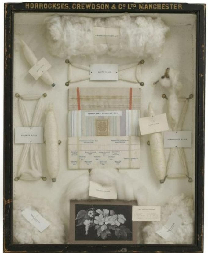
Fig 3 right: Glazed case displaying the processes in manufacturing cotton, from raw wool to yarn. £275