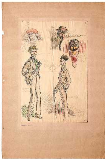
Jacques Vaché (1895-1919), Ces Messieurs , colored pencil, pencil, and ink on paper laid to Arches paper, under glass, 12 1/4" x 8", $46,875 (est. $15,000/20,000). John Moran Auctioneers, Monrovia, California, June 9.