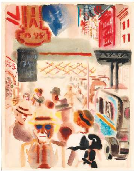
George Grosz (1893-1959), New York, Downtown Manhattan , watercolor on Michallet paper, under glass, 23 3/4" x 18 1/4", $31,250 (est. $18,000/25,000). John Moran Auctioneers, Monrovia, California, June 9.