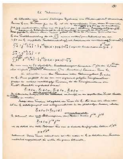
Albert Einstein handwritten scientific manuscript, circa 1945, $38,781 (est. $15,000 plus). RR Auction, Boston, Massachusetts, June 16.

This rare theatrical playbill printed on H.M.S. Resolute during its Arctic expedition in the 1850s was bought in an Epping, U.K., charity shop for £5 and sold for £4750 ($6554 U.S.) at Sworders Fine Art Auctioneers, Stansted Mountfitchet, Essex, U.K., on June 30. The unnamed consignor liked the framed piece after seeing another shopper inspect it and put it down again. The owner did some research and found that a similar example had sold at Christie's in 2004 for over £2000.