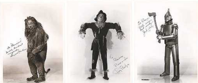
Set of oversize signed photographs of some of the cast of The Wizard of Oz , $62,500 (est. $50,000 plus). RR Auction, Boston, Massachusetts, June 16.