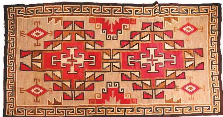
Navajo Crystal room-size rug, $11,875 (est. $2000/3000). John Moran Auctioneers, Monrovia, California, May 25.