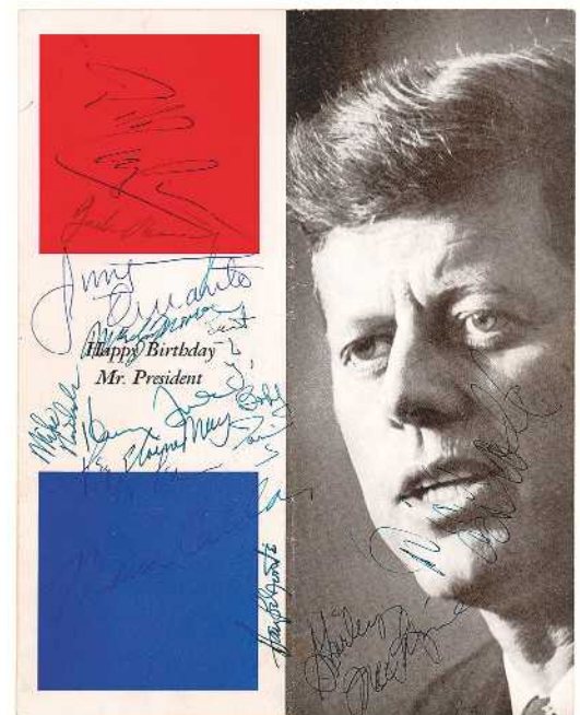
This original program for President John F. Kennedy's famous birthday celebration held at Madison Square Garden on May 19, 1962, titled "Happy Birthday Mr. President," two pages, 10 1/2" x 8 1/4", signed on the front in ink by Marilyn Monroe, Peter Lawford, Maria Callas, Jack Benny, Jimmy Durante, Henry Fonda, Bobby Darin, Mike Nichols, Elaine May, Peggy Lee, Harry Belafonte, Shirley MacLaine, and Diahann Carroll, sold for $29,233 (est. $12,000 plus). RR Auction, Boston, Massachusetts, June 16.