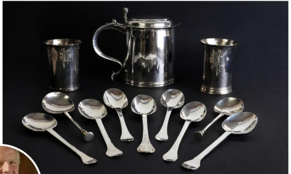
Silver which belonged to the Colman family will be auctioned