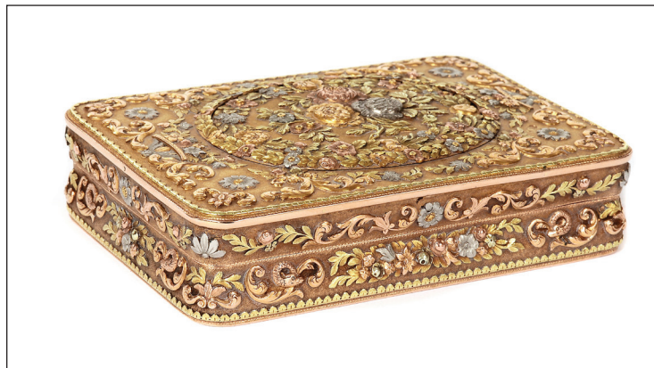
A Swiss or German Hanau four-color gold snuff box, circa 1820, with a later Russian standard mark 1908-17. A later lift out minaudière insert, hand engraved "Fairbanks."

He was also a confirmed Anglophile. Fairbanks Jr first lived in Britain in the 1930s after Warner Bros asked its stars to take a 50 percent Depression-era pay cut. He refused, was fired, and instead