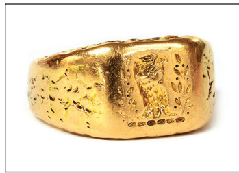
Douglas Fairbank's gold signet ring by Cartier, circa 1960, with a flat section square head, intaglio engraved with the Fairbanks crest.